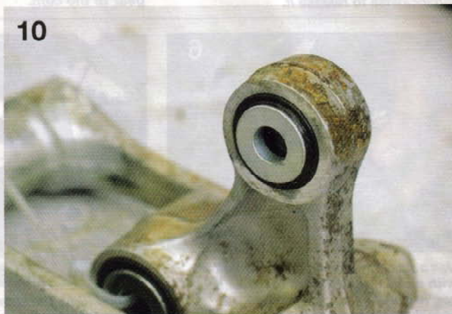
Take all your new parts and put them in the same way they came out and you're ready to rock. ☐