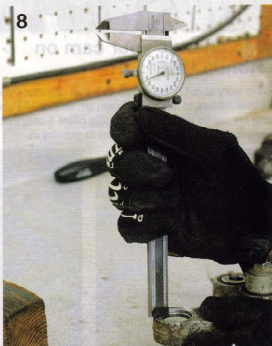
If you want to be super tech, you can use a caliper to measure it to center.