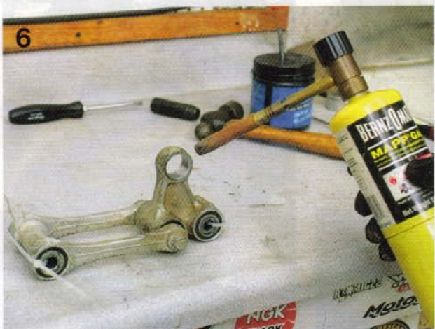
A secret ninja secret is to heat the aluminum so it expands and makes installing the frozen shrunken bearing easier. Fire is hot, don't burn yourself.