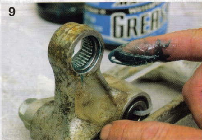
Lots of grease is key.