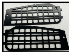
LH/RH Molle Door